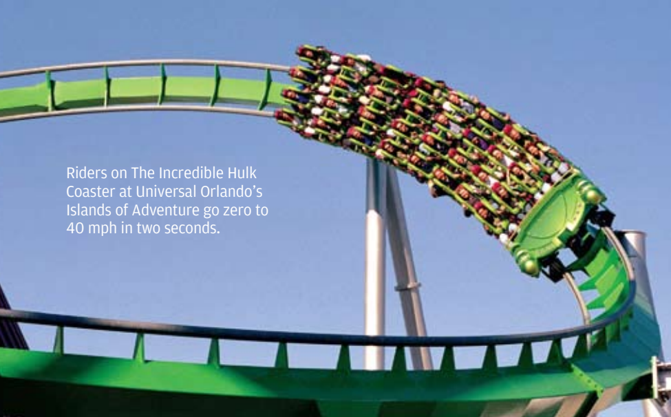
Riders on The Incredible Hulk Coaster at Universal Orlando's Islands of Adventure go zero to 40 mph in two seconds.

Despicable Me Minion Mayhem ride. universalorlando.com . 6000 Universal Blvd., Orlando, 407-363-8000.