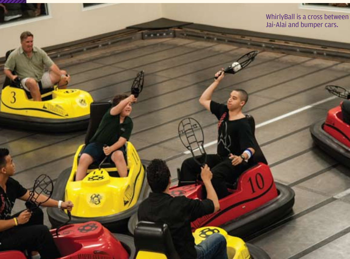
WhirlyBall is a cross between Jai-Alai and bumper cars.

DISNEY'S OSPREY RIDGE GOLF COURSE Wind, sand, water and bunkers are the primary challenges on this North Carolina-style course. Elevated tee boxes and target-area greens provide excellent landscapes as you set up your shot. The 17th hole, with a green sloped toward a large lake, was named the hardest par-3 in the region by one TV station poll. disneyworld.disneygo.com/golf . Located near Fort Wilderness Resort & Campground, Lake Buena Vista. 407-939-4653.