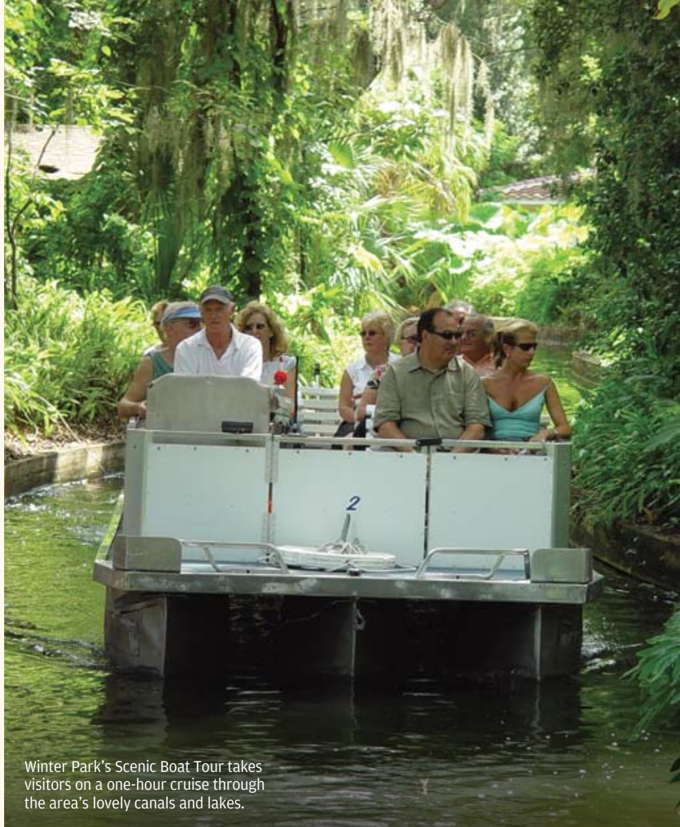
Winter Park's Scenic Boat Tour takes visitors on a one-hour cruise through the area's lovely canals and lakes.

FLY HIGH HELICOPTER TOURS Nine flight options plus three eco tours to show you the real Florida. orlandohelicenter.com . 4623