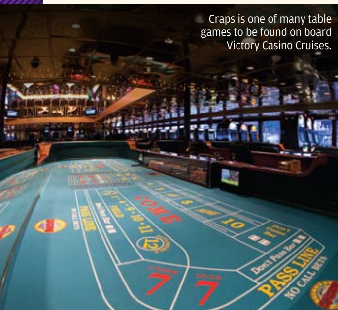
Craps is one of many table games to be found on board Victory Casino Cruises.

VICTORY CASINO CRUISES Pick one of the twice-a-day cruises and enjoy classic casino action such as blackjack, three-card poker, craps, roulette, a sports book—and tons of slot machines. A big draw: lots of $5 minimum tables. Victory also offers a daily buffet and nightclub action. Terminal B-2, 180 Christopher Columbus Drive, Port Canaveral. victorycasinocruises.com . 855-468-4286.