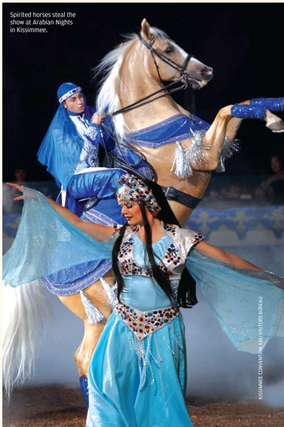
KISSIMMEE CONVENTION AND VISITORS BUREAU

Spirited horses steal the show at Arabian Nights in Kissimmee.