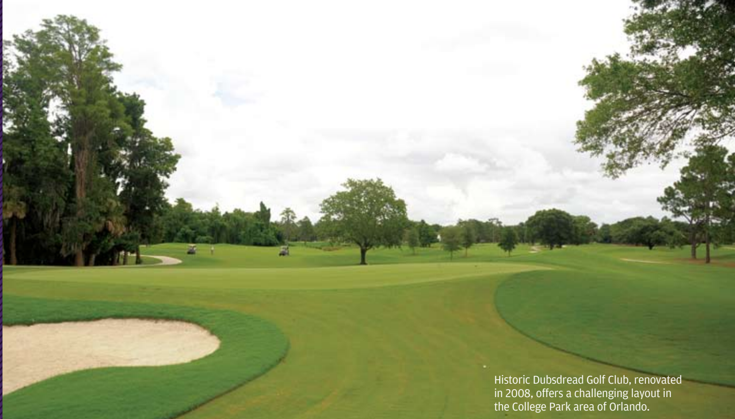
Historic Dubsdread Golf Club, renovated in 2008, offers a challenging layout in the College Park area of Orlando.

DISNEY'S PALM GOLF COURSE Shorter and tighter than its sister course, Magnolia, the Palm is a classic Florida layout with elevated greens and tees and lots of water. The sixth hole begins with a narrow fairway sandwiched between an alligator-inhabited lake and woods. The fairway is then interrupted by yet another body of water, before reaching the green, perched on a rock bulkhead. disneyworld.disney.go.com/golf . Located near the Polynesian Resort, Lake Buena Vista. 407-939-4653.