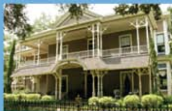
Amelia Island Williams House www.WilliamsHouse.com