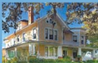
Hoyt House www.HoytHouse.com