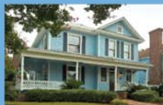
Blue Heron Inn AmeliaIslandBlueHeronInn.com