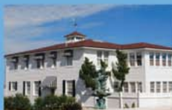
Amelia Oceanfront www.AmeliaOceanfrontBB.com