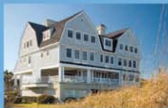
Elizabeth Pointe Lodge www.ElizabethPointeLodge.com