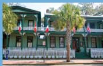
The Florida House www.FloridaHouseInn.com