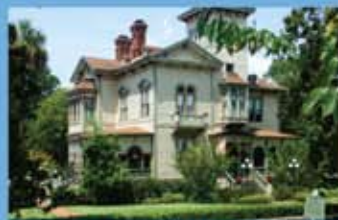
Fairbanks House www.FairbanksHouse.com