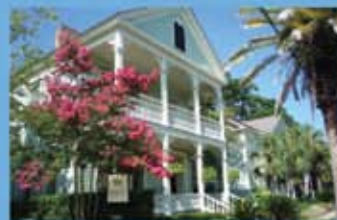
Addison on Amelia www.AddisonOnAmelia.com