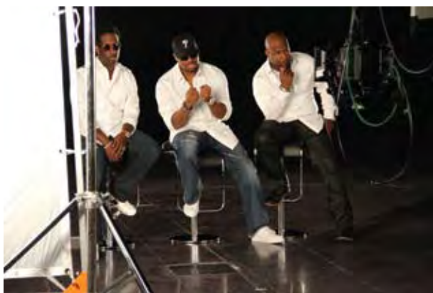
Full Sail students helped with filming and production of a music video for R&B super group Boyz II Men.

Full Sail University has always focused on providing students with an educational experience that mirrors the production environments found in the entertainment and media industry. And more than ever, its Central Florida campus has proven to be a hub of opportunity when it comes to students getting real time on real projects – whether it's working with sports organizations, musical artists, or major media companies.