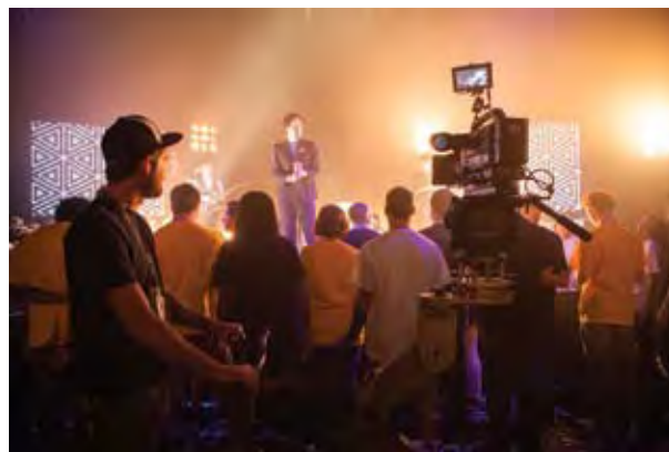
The intro to the Major League Soccer Playoffs – featuring British rock band The Chevin – was filmed on the Full Sail campus.

Located in Winter Park, Florida, Full Sail University is an award-winning educational leader for those pursuing careers within the entertainment and media industry. Founded in 1979 as a recording workshop, the school has rapidly grown to offer associate's, bachelor's and master's degrees, both on-campus and online, that span a wide range of disciplines – from film and live event production, to video game design and computer animation, to entertainment business and music production. Learn more at fullsail.edu or call 800.226.7625. For more information, visit fullsail.edu