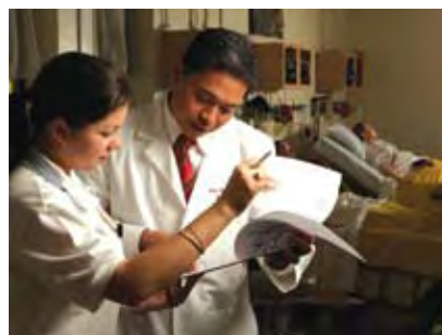
Barry University offers a variety of programs in Orlando, including anesthesiology, emergency management, and public administration.

For more information on these and other programs, please visit www.barry.edu/OrlandoMagazine .