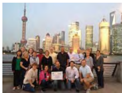
UCF EMBA Class of 2013 during their international residency in China

In addition to Master's Degree programs, the EDC offers a variety of Executive Education seminars that help individuals and organizations develop new business skills and capabilities. For more information about our upcoming programs, please visit our website at: www.UCFExecutiveEducation.com .